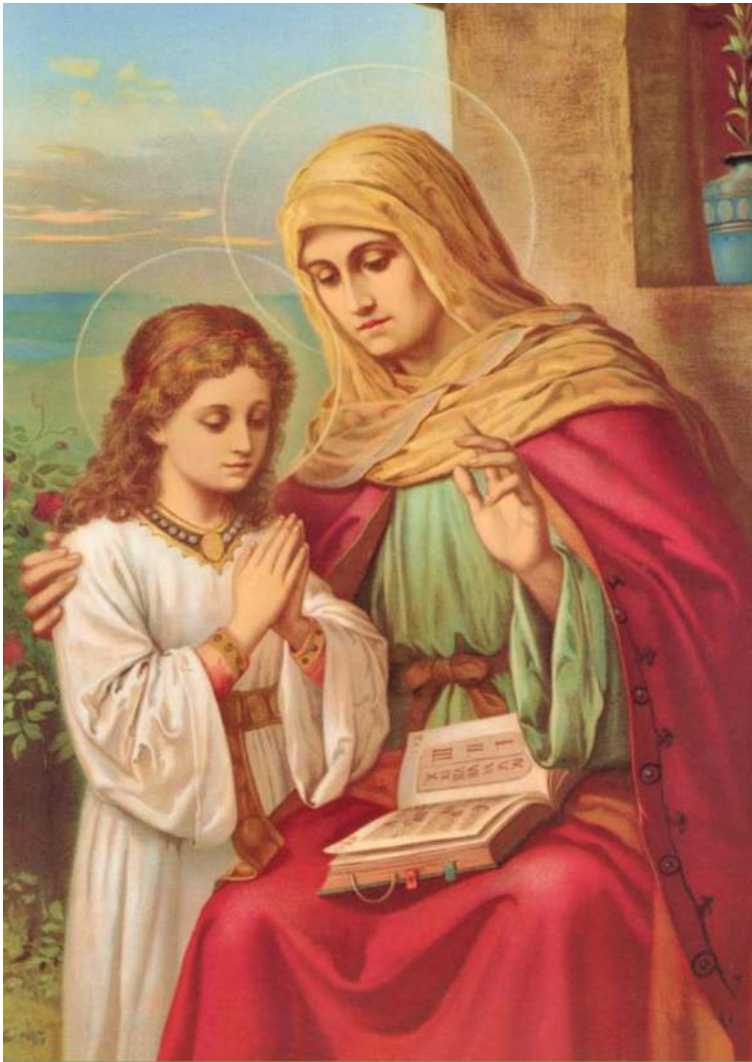
Saint Anne Prayer

Good Saint Anne, obtain for me an increase of faith in the great mystery of the Holy Eucharist. Help me to see in this great Sacrament Christ our High Priest, making real for me the saving grace of His death on the cross; feeding my soul with His Flesh and Blood so that I may live in Him and He in me; producing the unity of the people of God and gathering His Church together. By your powerful intercession with God, help me to center my life around the altar that I may inherit the promise of the Lord: "He who eats my flesh and drinks my blood, has life everlasting." Amen.